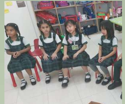
"Sunshine Crooners: Harmonizing Joy with Hand and Cup Rhythm!"