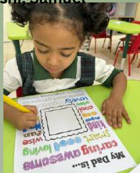
"To the best dad in the world, with love from your little star!"