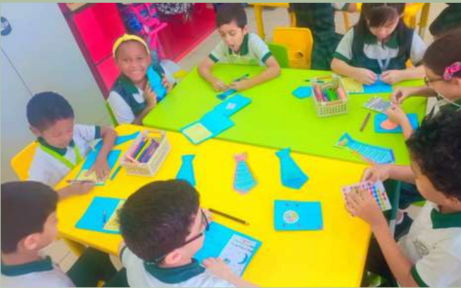
KG2B- Designing cards for their fathers