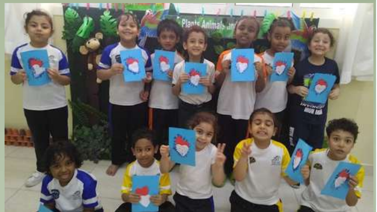
KG2A -Making Father's Day card