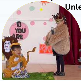
Besan the Wise Owl