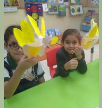
"Feathers and Innovation Take Flight: Hen STEAM Adventure Soars High!"