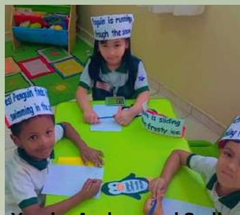
Yamin, Andrea and Sadiq- "Sentence construction: Unlocking the magic of language." KG2B