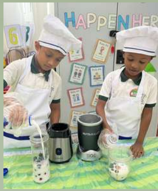
"Budding Chefs, Berry Bliss: Whipping Up Delightful Smoothie Twists!"