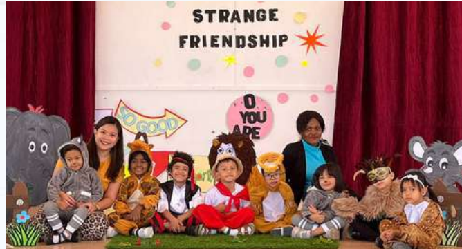
"Where Courage Meets Compassion: Unlikely Bonds Unleashed"