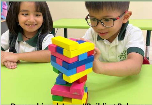
Devanshi and Jose - "Building Balance, Block by Block."