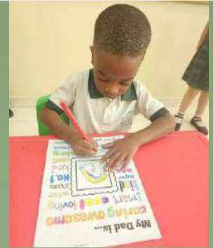
"Daddy, my love for you is as big as the sky!"