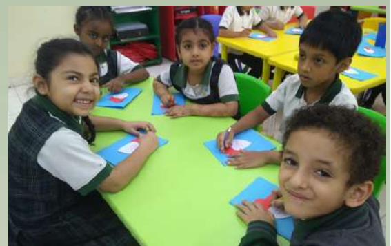
"To the dad who makes me feel like the luckiest kid in the world, with love from your little one."