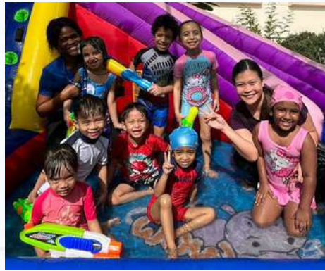
"We're making waves of laughter and joy!"