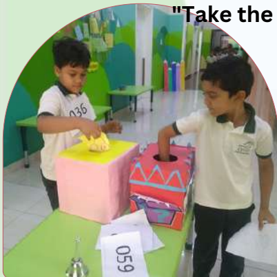
"Race Against Numbers in the Thrilling Math Marathon!"

"Take the Lead in the Math Marathon and Win with Numbers!"