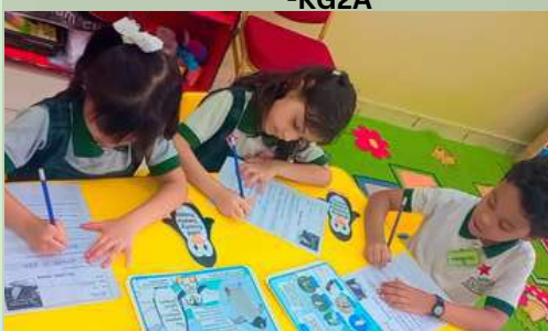
Eunice, Roaa and Yusuf-"Facts, Flippers, and Fun: Explore Penguins through the Power of Writing!"KG2B