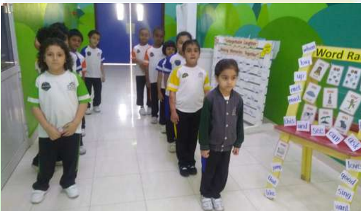
KG2 students ready for Word Race activity.

"SEEK, FIND, AND TRIUMPH IN THE WORD CHALLENGE!"