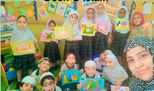
"Deen-E-Islam: Where Faith and Beauty Embrace in Our Mosque Design!"