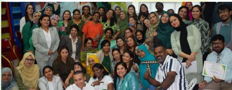
"Unleashing Potential, Defying Limits!"

"HONOURING THE HEROES WHO LIGHT THE WAY, NURTURING KNOWLEDGE AND FOSTERING GROWTH. THANK YOU, TEACHERS, FOR YOUR TIRELESS DEDICATION! #TEACHERSROCK #CHANGINGLIVES".