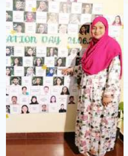
"Nurturing Hearts, Inspiring Minds!"