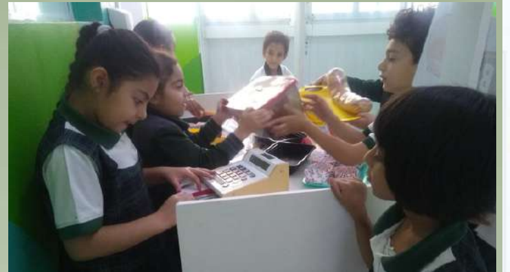
"Discover the Art of Negotiation: Market Role Play Unleashed!" KG2A students