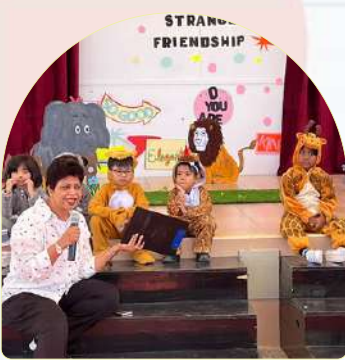
"Blossoming Stars: Shining Bright Together!"