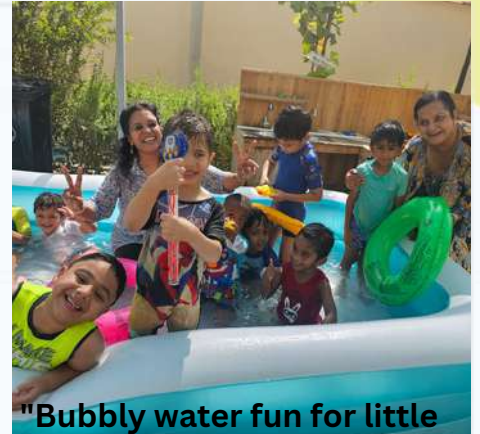
"Bubbly water fun for little ones!"