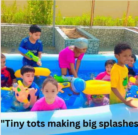
"Tiny tots making big splashes!"