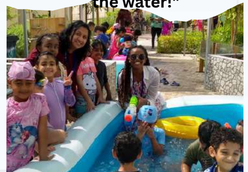
"Experiencing the Ultimate Splash Day Adventure!"