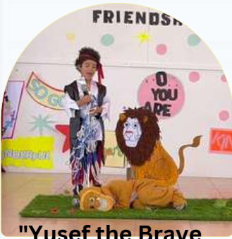
"Yusef the Brave Hunter!"