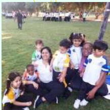
Grizzly bears groupie!

Children's Day is simply meant for PLAYING!