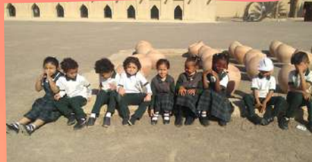
Material used to build the fort and feeling the texture.