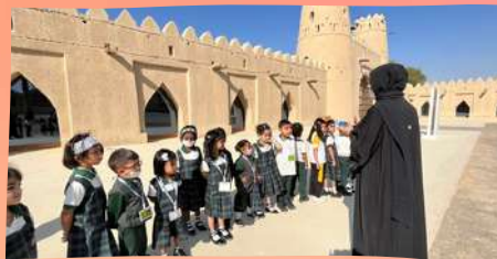
Host guiding students about the history and structure of the fort.