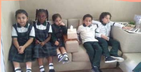
Students engaged watching informative story videos.