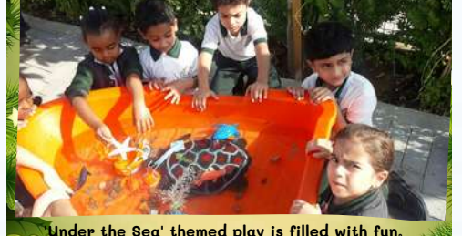
'Under the Sea' themed play is filled with fun, hands-on activities, creative, and educational play.