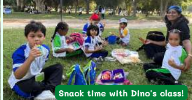
Snack time with Dino's class!