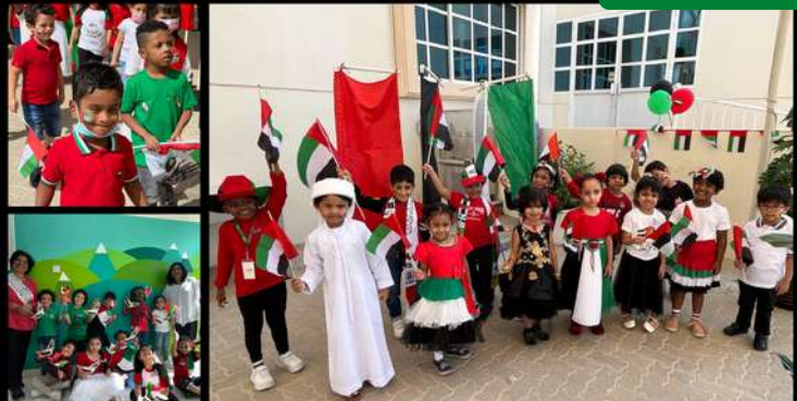
Dress in the colors of the flag and learn to sing the National Anthem of UAE.

This year's celebrations were held under the theme of "patriotism and unity" in line with the general theme of National Day celebrations across the nation.