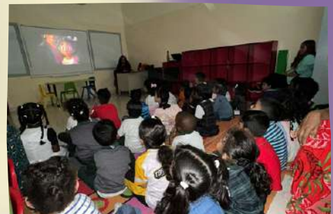
Students enjoyed watching 'Encanto' - a kid-friendly musical and creative movie that captured the hearts of kindergartners through its catchy songs, detail-oriented visuals, and captivating story.