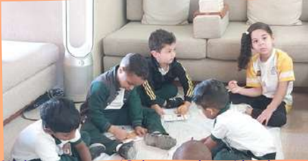
Welcome activity 'Colouring sheets' by the host!

Jahili Fort is a symbol of power and as a royal summer residence. The fort is regarded as a monument of heritage, history and civilization.