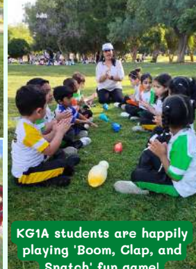
KG1A students are happily playing 'Boom, Clap, and Snatch' fun game!