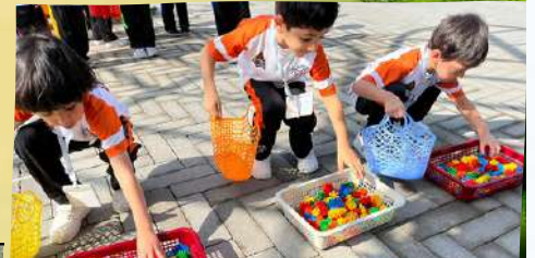
Math can be a fun, interactive activity!

Discovery- based learning has a number of benefits which help develop students. It encourages active engagement from students, promotes motivation, promotes autonomy, responsibility, independence, develops creativity and problem-solving skills and provides a tailored learning experience for that student.