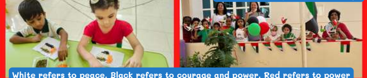
White refers to peace. Black refers to courage and power. Red refers to power and sovereignty.