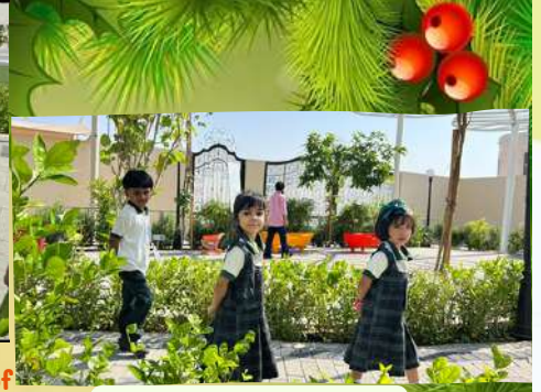
Number sense sorting