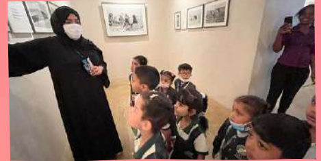
Talking about the UAE currency having Jahli Fort's picture. (Aed 50)