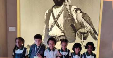
Children enjoying the architecture inside the fort.