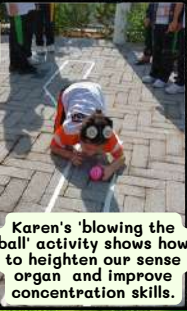
Karen's 'blowing the ball' activity shows how to heighten our sense organ and improve concentration skills.