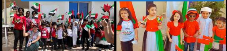
The purpose of the ceremony is to honor the flag. It is a way of showing love and respect for one's country.