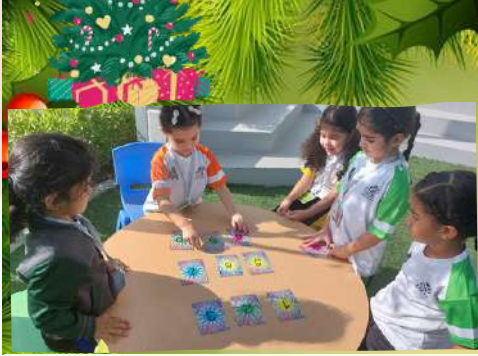
This is how we come across 'after numbers'!