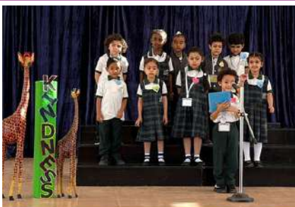
Melman's class performed on stage about 'Kindness'.