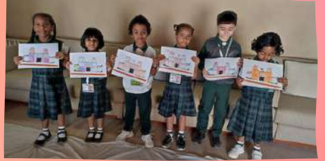
This is how we coloured our sheets!