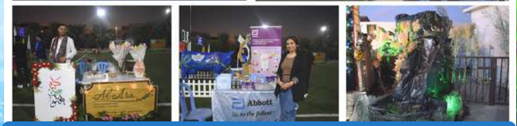
Pavilions from different countries with the participation of our dear parents from different grade levels.