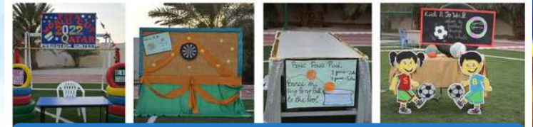
Exciting games, wonderful freebies, and amazing prizes!