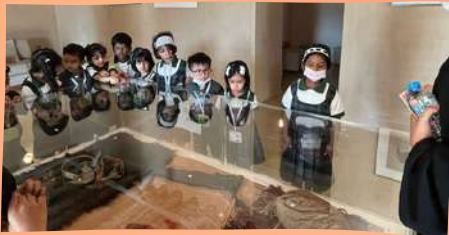
Host showing bottle pack have 'Al Jahili fort' picture on it.