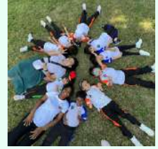
Unicorn's class lying in circle for a nice pic!