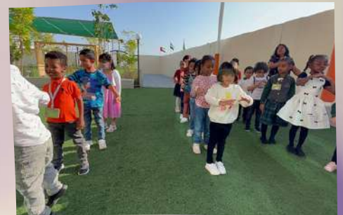
Senior KG's warming up exercise with enthusiasm!