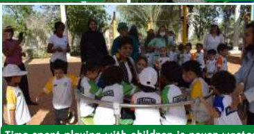
Time spent playing with children is never wasted...