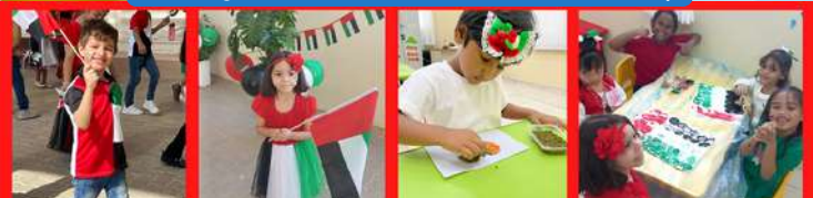
All four of which stand for Arabian unity. Green refers to goodness and agriculture, abundant throughout the country.