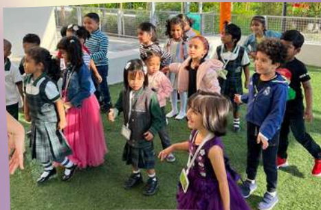
Junior KG students dancing 'Hokey Pokey' with groove!

Kindergartners were thrilled and super excited for 'Children's Day Out'. It was a great time to catch up with the whole school playing fun games and relaxing activities with music and mouth-watering food to build memories and enjoy the presence of others. Superb Day Out!