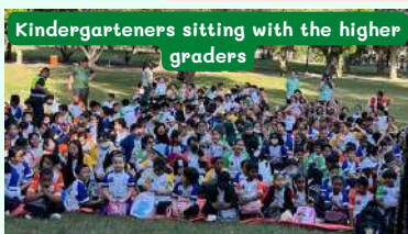
Kindergarteners sitting with the higher graders