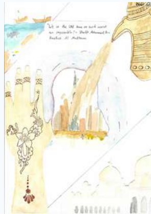
Nur Eimaan 6B