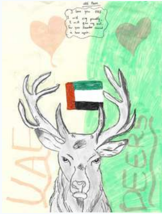
Hana Saeed 6B